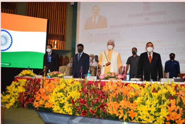
National Anthem being played at the beginning of the Conference