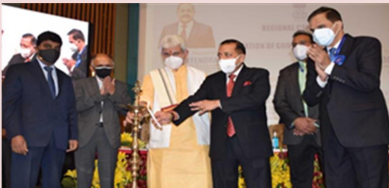
Dr. Jitendra Singh Rana, Hon'ble MoS for PMO, inaugurating the Regional Conference on Replication of Good Governance Practices at SKICC, Srinagar, on July