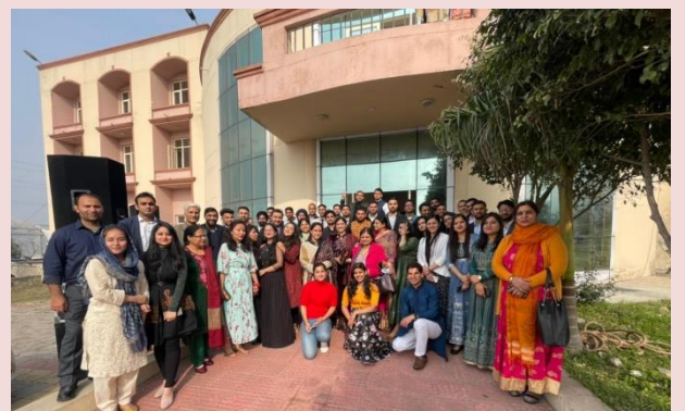
JKAS Probationers Foundation Course Batch 2019 at IMPARD Regional Centre, Jammu