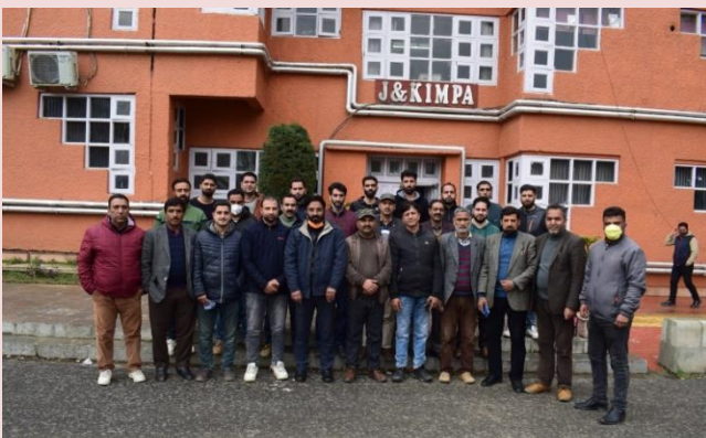
Orientation Training on "Gram Panchayat Development Plan" held at IMPARD Main Campus, Srinagar w.e.f. April 05-08, 2021

With a view to achieve uniform, inclusive and holistic development across the length and breadth of rural India, need has been felt for enthusiastic participation of Elected Representatives, Panchayat Functionaries, Government Departments, and the rural folk in general, in the formulation of Gram Panchayat Development Plans (GPDP) for implementation during a budget year.