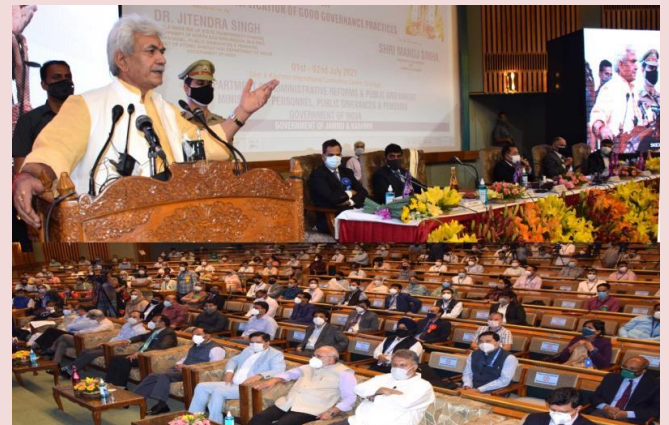
His Excellency Lieutenant Governor of UT of J&K, Shri Manoj Sinha, addressing the participants of Regional Conference on Replication of Good Governance Practices at SKICC, Srinagar