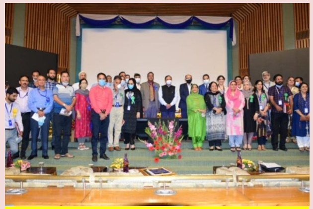
Officers and the faculty of J&K IMPARD at the Conference