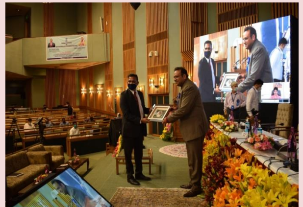
Shri Saurabh Bhagat, IAS, DG IMPARD presenting memento to a dignitary during the Conference