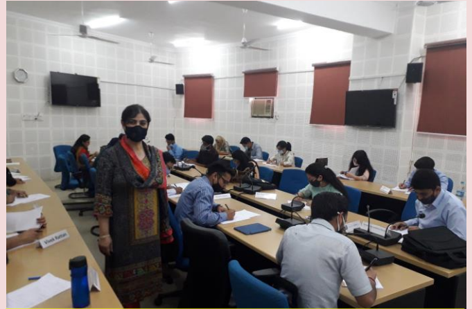
Examination of Financial Management Module of JKAS Probationers of Batch 2020 in progress