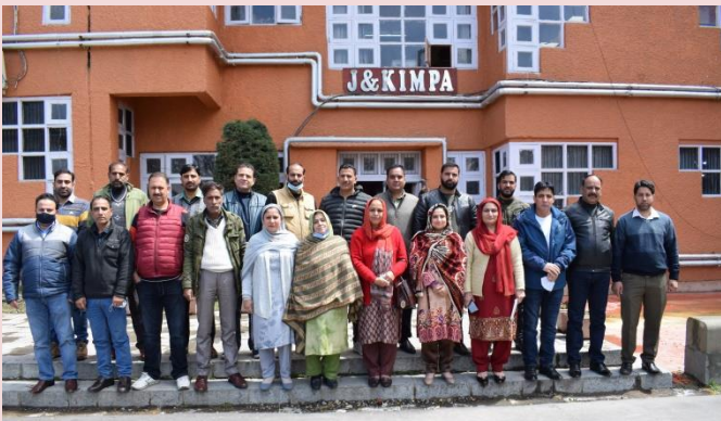
Training Course on "Ethics & Values in Public Governance" held at IMPARD Main Campus, Srinagar w.e.f. April 05-07, 2021